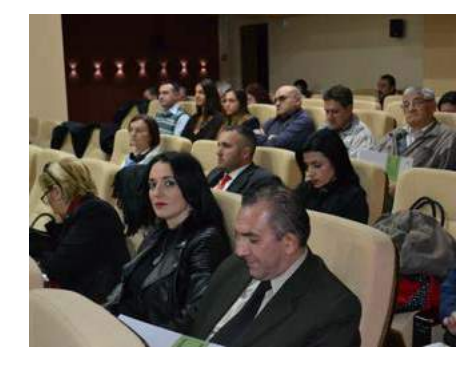
by CNVP – Organisation on linking natural values and people, the Rural Development Network of the Republic of Macedonia and AkRRa – Action for Rural Development is financially supported by the European Union.

tatives of active rural civil organisations in Macedonia. They were informed by the partners about the project and the opportunity to be directly involved as users in implementation of project activities in 2018. The project implemented