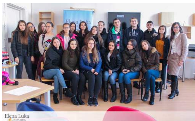
Workshop on prevention of gender based violence, Municipal Secondary School Slavcho Stojmenski, Shtip, 9 December 2016

Twenty human rights workshops were implemented by the Elena Luka Foundation as part of the project 'Prevention of Gender-based Violence' with pupils from primary and secondary schools, young people and women and mothers. Workshops addressed topics such as gender equality, non-discrimination, and gender based violence. The workshops were carried out in 6 municipalities with about 400 participants. The objective is to create a society with equal opportunities for all.