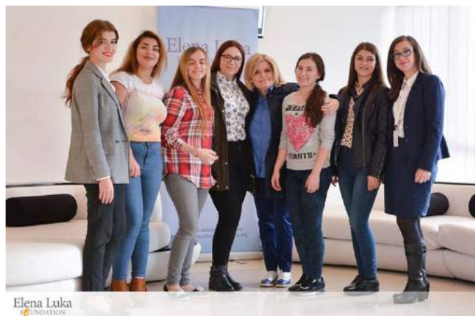
Contracts for higher education scholarships were signed on 28 October 2016

The Elena Luka Foundation awarded five scholarships for five female students from the municipalities of Lozovo, Mogila, Centar Zupa, Chaska and Skopje as part of the Plan Your Future Project. Eligible candidates met the criteria prescribed in the published call and upon their ranking the grades of the female students and the monthly family income was taken into account. This Foundation has already awarded five scholarships for five female students from the same municipalities.