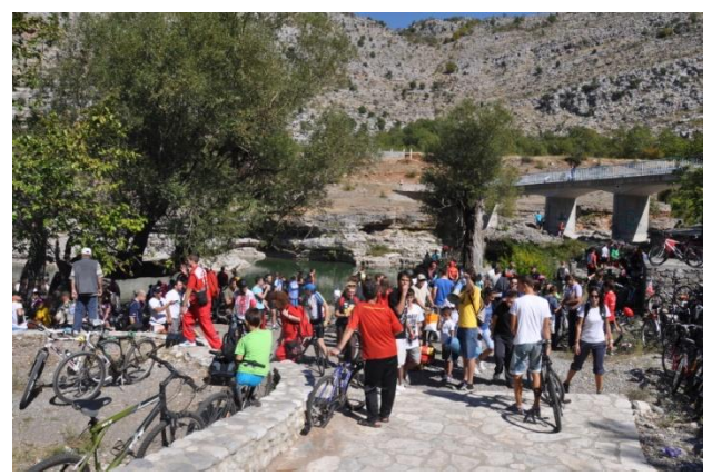
World Car Free Day in Montenegro

awarded prizes, and Montenegro Red Cross distributed bicycle helmets and informational material. The Red Cross supported this action by providing a first aid team for the participants of the tour. A two-hour break was made in Trgaja, when members of the first aid team from the municipal organization of Red Cross of Podgorica demonstrated first aid methods in a simulation of a traffic accident.