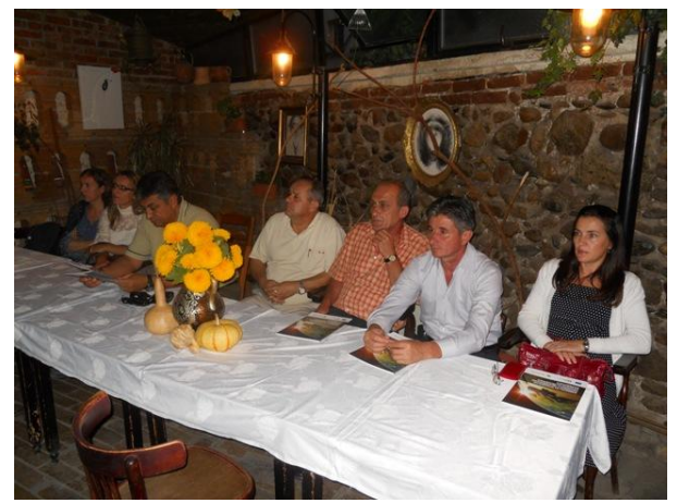
Climate Challenge vs. Macedonian Response

In the end of September, CSO Molika facilitated a debate with the subject "Climate challenge vs. Macedonian response", where network members discussed the current situation and climate change in the region of Bitola. Participants were interested in the local fires, how they reflect on the loss of forests and thus the reduction of clean air around Bitola. At the end of the debate, members of the physics club from primary school Dame Gruev shared their knowledge on the HAARP systems and their effects on human health and climate. The general conclusion of the event was that only joint and coordinated activities between civil society and local government can better educate the population about the risks of climate change and ways to adapt to it.