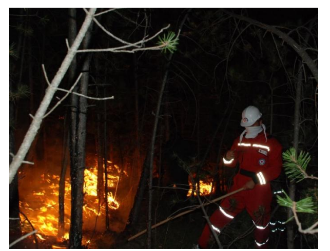
Red Cross volunteer involved in a disaster management action

The summer 2012 was a very hot period in the SEE region – dry periods without any rain lasted for dozens of days, with temperatures reaching record high levels.