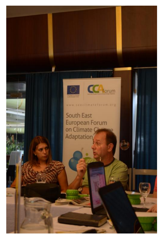
Impression from recent team meeting in Trogir

Since the IPA funded project will officially end with this year, the project team will meet once again. While a review of all activities and events within this project will be a major part of it, the main focus will of course lie on the future of the "SEE Forum on CCA". The steps ahead will be based on the work that has been done so far in the national networks and on the regional level by all partners. The following points especially build the base for the future direction: the Climate Vulnerability Assessments reports on the national level and the regional synthesis report contain the scientific grounds from which concrete recommendations have been identified. These are again the base of the advocacy strategies that are developed for each country. Also, following our decisions made in the Sutomore conference and deepened in Zagreb, further implementation of activities from the joint action plan will be looked upon.