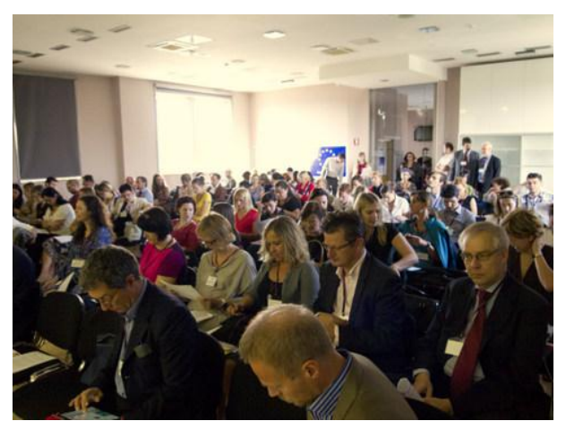
Regional CSO conference in Zadar

From 26 to 28 September 2012, more than a hundred representatives of civil society organizations, support agencies, government and EU institutions gathered in Zadar, Croatia to assess the state of civil society and its development in the Western Balkans and Turkey. This event was jointly organized by European Citizen Action Service (ECAS), the National Foundation for Civil Society Development, TACSO, the People to People Programme of the European Commission and Directorate General for Enlargement. There were three main topics for the conference: benchmarking the progress across the region, sustainability of civil society and the outlook for EU policies in the region. The general conclusion of the conference was that the region has advanced significantly when it comes to providing the environment for civil society development and that ECAS should endorse numerous ongoing regional processes in that direction. Visit the official ECAS website for more information.