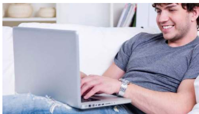
Incorrect laptop hold frequently seen in young people

A recommendation for using a laptop is on a little table or a pillow more than 10 cm thick, to reduce electromagnetic radiation to safe intensity.