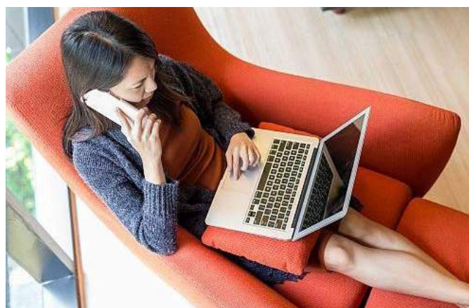
Correct hold of a laptop on your lap

A recommendation for using a laptop is on a little table or a pillow more than 10 cm thick, to reduce electromagnetic radiation to safe intensity.